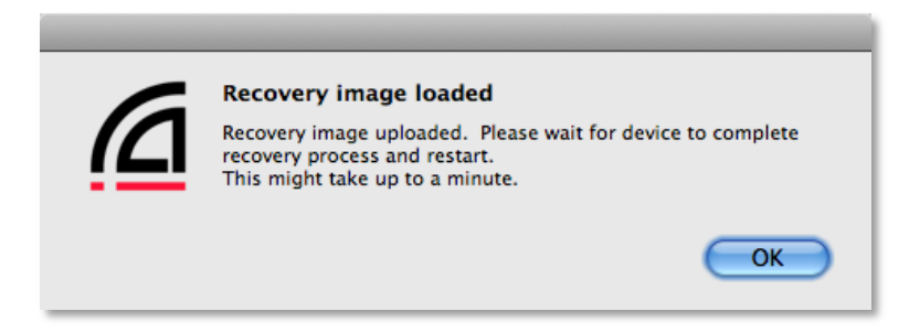
Figure 7 - Image loaded notification

12. The Dante device will write the recovery file and when finished, will automatically reboot.