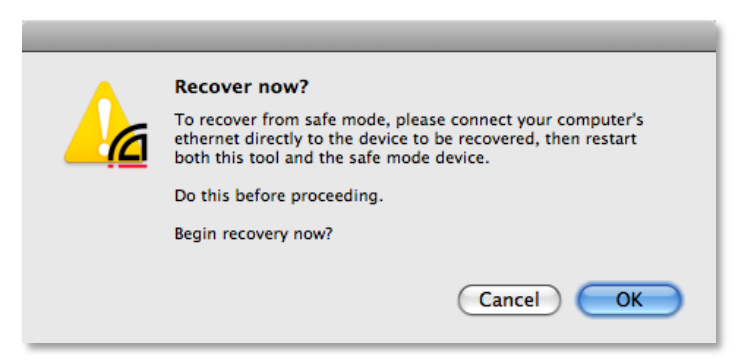
Figure 6 - Confirm recovery notification

You will receive the following message confirming that you have your network set up correctly.