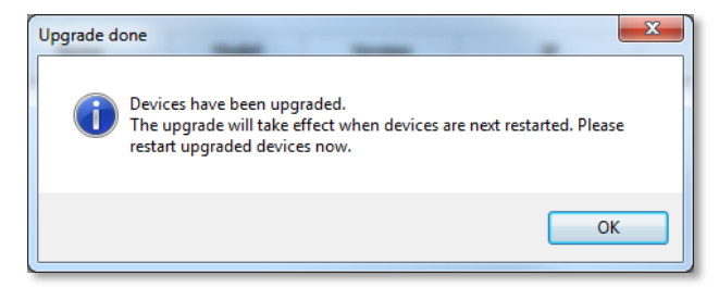
Figure 4 - Upgrade complete notification

8. Power cycle the Dante-enabled audio devices that have been upgraded, to finish applying the firmware update and restore your configuration. If the device is not power cycled or rebooted, the update will not be applied.