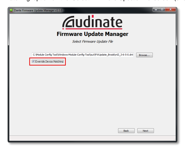
Figure 8 - Override Device Matching option

If your Dante module is running the wrong firmware (for instance, if it has been updated with firmware for a different manufacturer) it is possible to 'force' an update file onto the module, using the 'Override Device Matching' option on the 'Select Firmware Update File' screen (shown below).