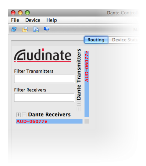
Figure 5 - Dante Controller showing device in failsafe mode

Also, for devices with LEDs, all status LEDs on the device will be red.