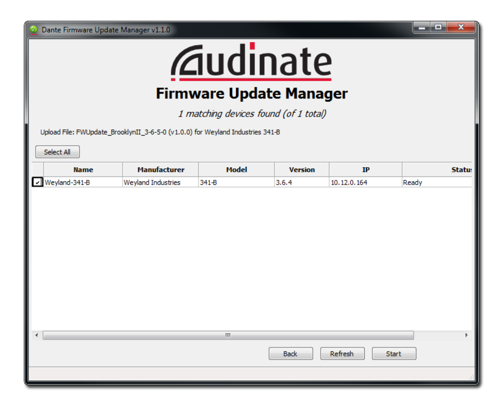
Figure 3 - Matching devices