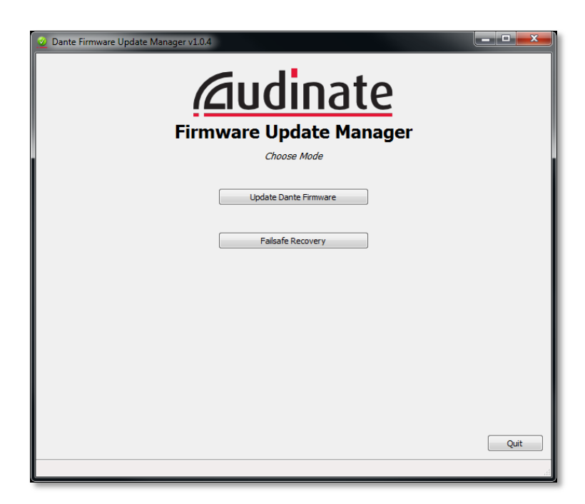
Figure 1 - Start screen